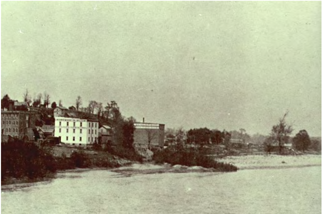
The Doron Bros. Electrical Company's first radio manufacturing shop (white building) on North B St. at Wayne St. in the former Blum & Co. Furniture Factory (204 N B St.) before they moved further north on B Street into another building during 1918 and then moved again further north to the 325-329 North B Street building (see page 4)