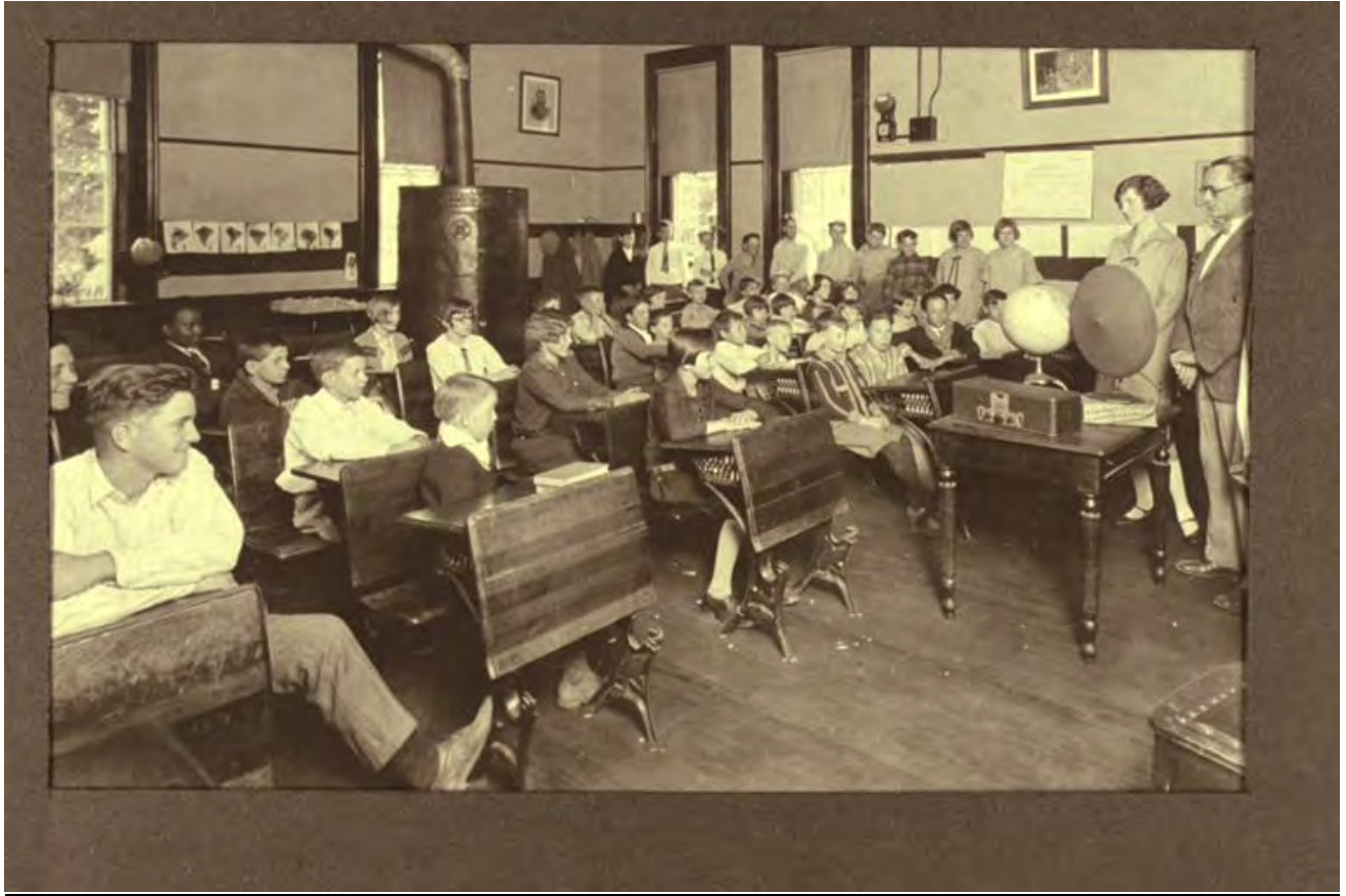
A WRK radio class (school unknown, date unknown)