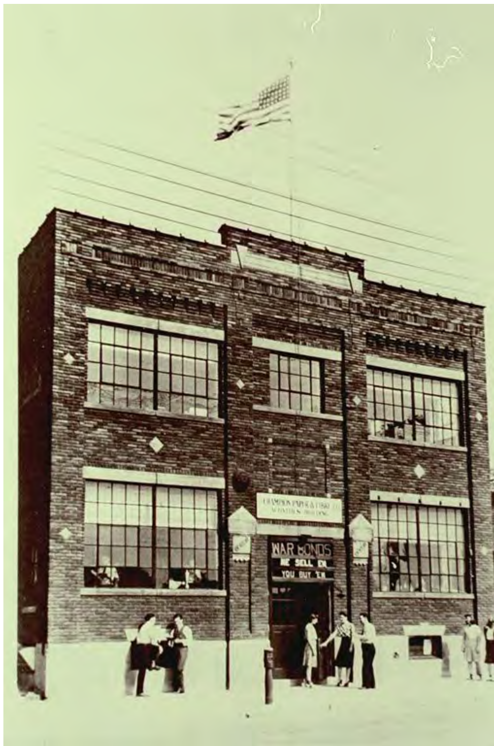
Building built by the Dorons on North B Street for manufacturing radios (later became the Champion Paper Company activities building) (picture circa 1943)