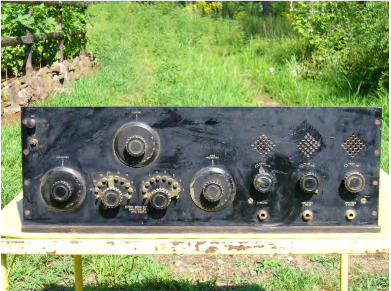
Doron Bros. Electric Company c1920 "Type R.D.2-A" 3-tube battery radio